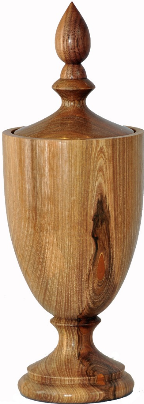
Walnut Cup urn

With the base section section firmly in the chuck shape the outside, and then hollow out forming a shelf to accommodate the lid. (See plan).